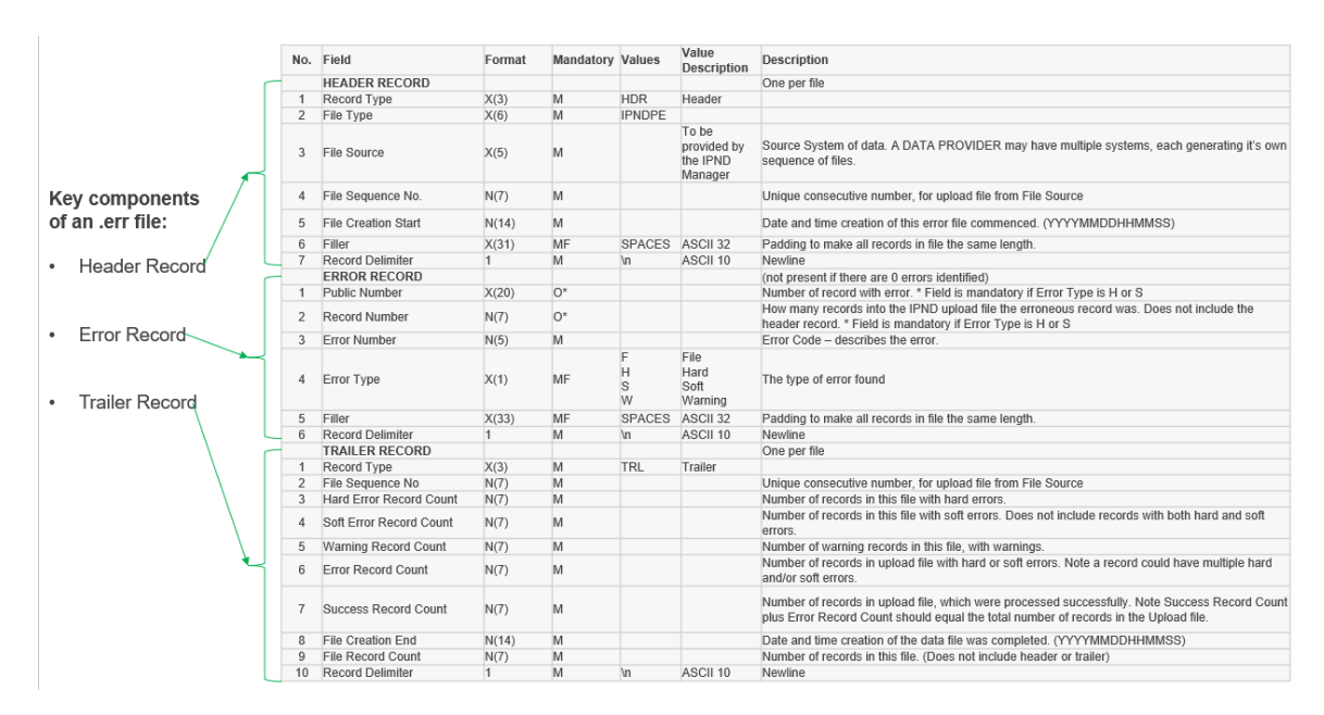
Figure 1 - IPND error file Report - Key Components