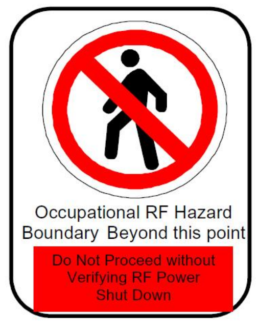
FIGURE F3 Example of an RF Hazard Identification Sign

RF EME Hazard Identification sign is used to identify the boundary point of occupational EME exposure.