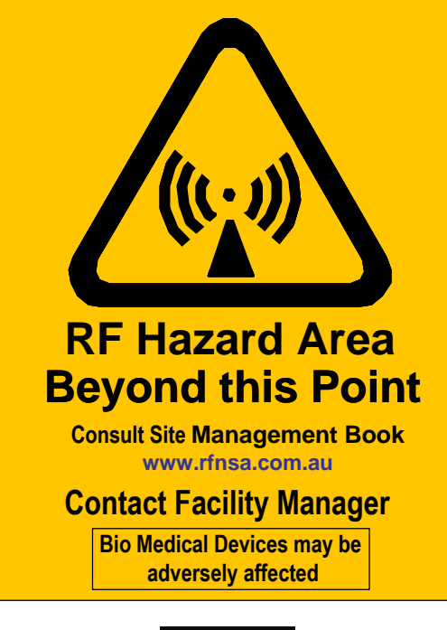
FIGURE F2 a Example of an EME warning sign

RF EME warning signs are used to identify areas that may exceed the general public and occupational exposure limits. These signs are to be installed at point of access restriction.