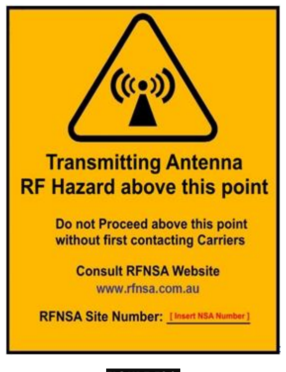
FIGURE F2 b Example of an EME warning sign (Small scale infrastructure)