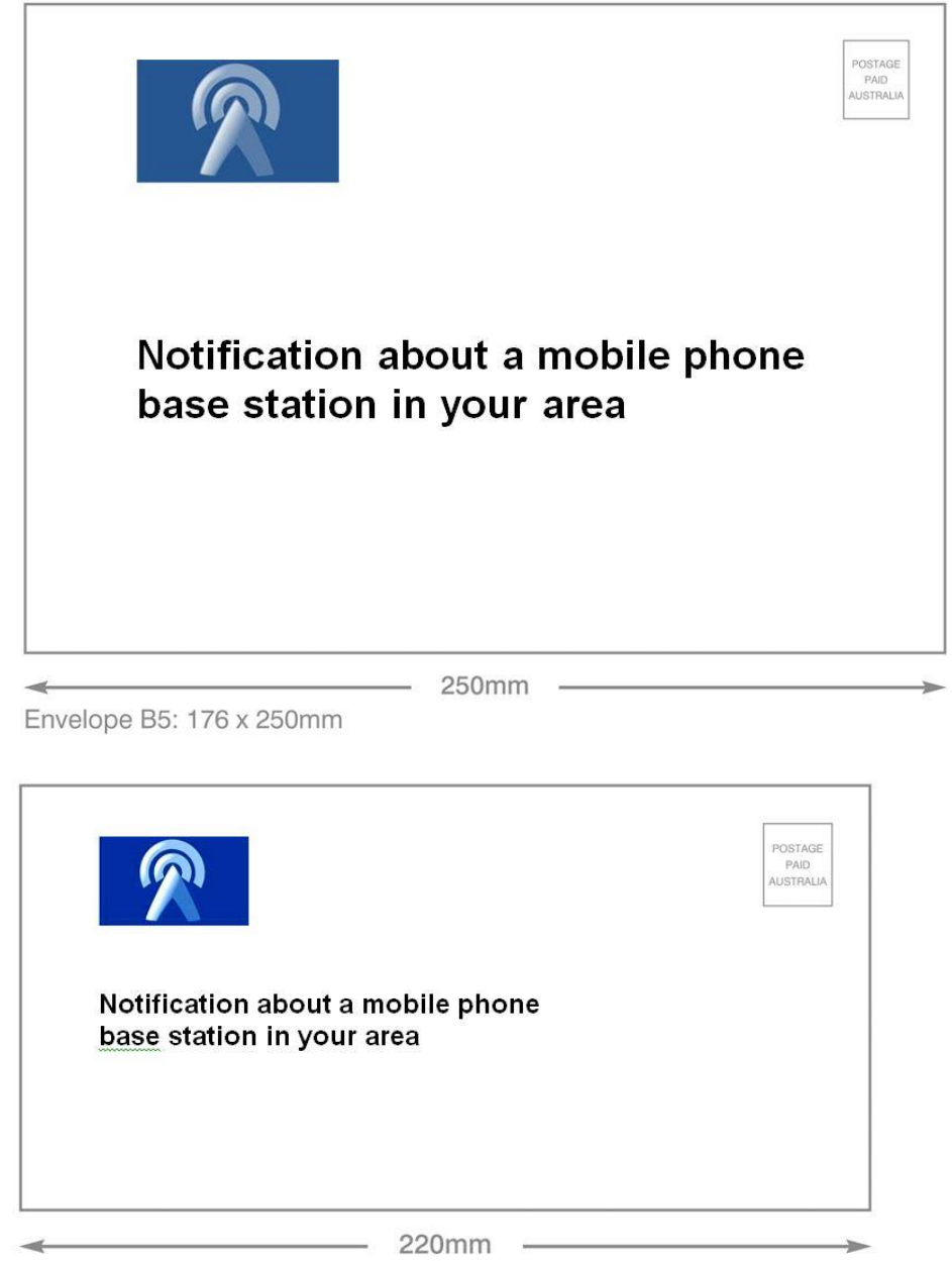
Envelope DL: 110 x 220mm

When distributing this correspondence, the Carrier should ensure that envelopes are delivered to letterboxes marked with 'no junk mail' or similar.