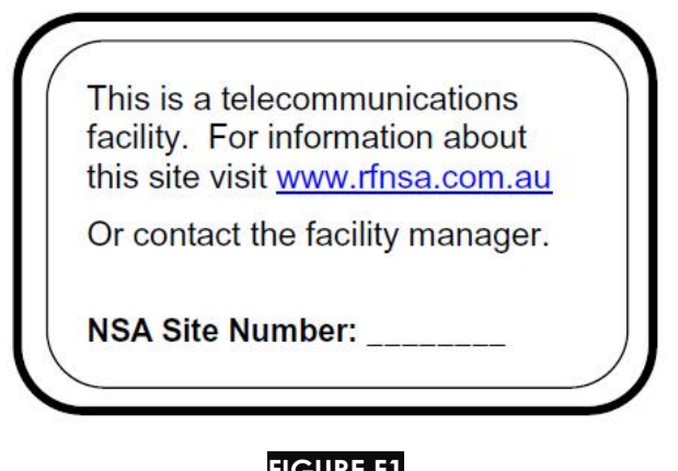
FIGURE F1 Example of an identification sign

The following sign is used to identify a mobile telecommunications facility and to provide information regarding the National Site Archive (NSA) site number.